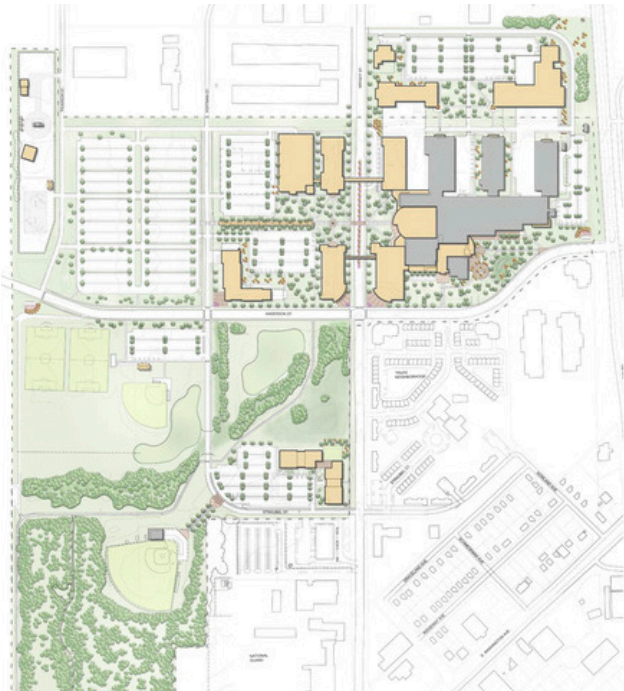
MADISON COLLEGE TRUAX CAMPUS CONCEPT