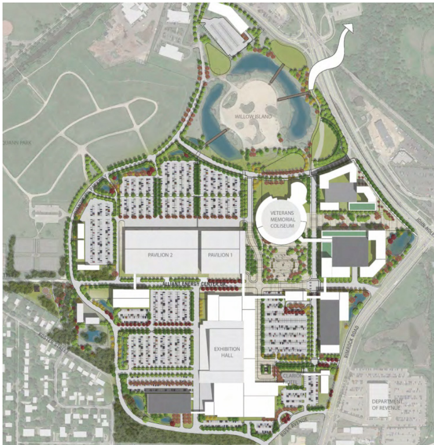
ALLIANT ENERGY CENTER MASTER PLAN

Master planning DEFINES a clear path for your future, DETERMINES your needs and goals, and ESTABLISHES a plan to accomplish it.